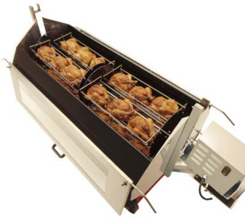
REVOLVING BASKET SPIT FOR CHICKEN