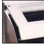
2 removable flap-doors with tempered glass windows.