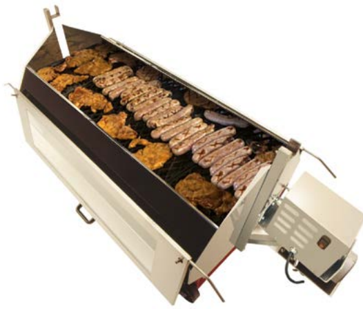
CAST IRON COOKING GRIDDLES