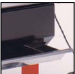
Stainless steel drip pan.

All stainless steel and porcelain enamel. Easy access for maintenance and high pressure cleaning. Low maintenance. Pilot-thermocouple. Gas safety valve. Stainless steel burner (engineered and manufactured by Rotisol). Propane or natural gas. Quick change accessories. Heavy duty removable motor. Drip pan can double as a cutting board.