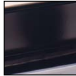
Porcelain enamel finish.