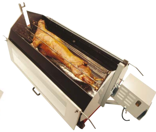
TURKEY, PIG, HAM & SHEEP SPIT